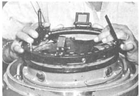
Figure 9-2.—Taking an azimuth.

The inner lip of the azimuth circle, in figure 9-2, is graduated counterclockwise in degrees. It is