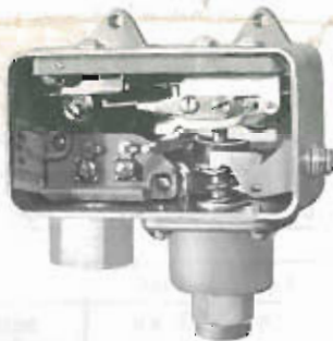
Fig. 1 — Screwdriver adjustment model.

ENCLOSURE: WATERTIGHT SERVICE: NAVY A SHOCK: CLASS HI